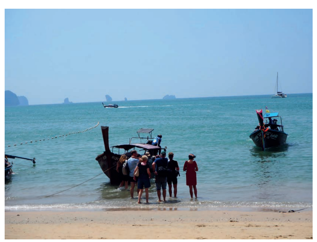
Fig. 5.2 for Question 5