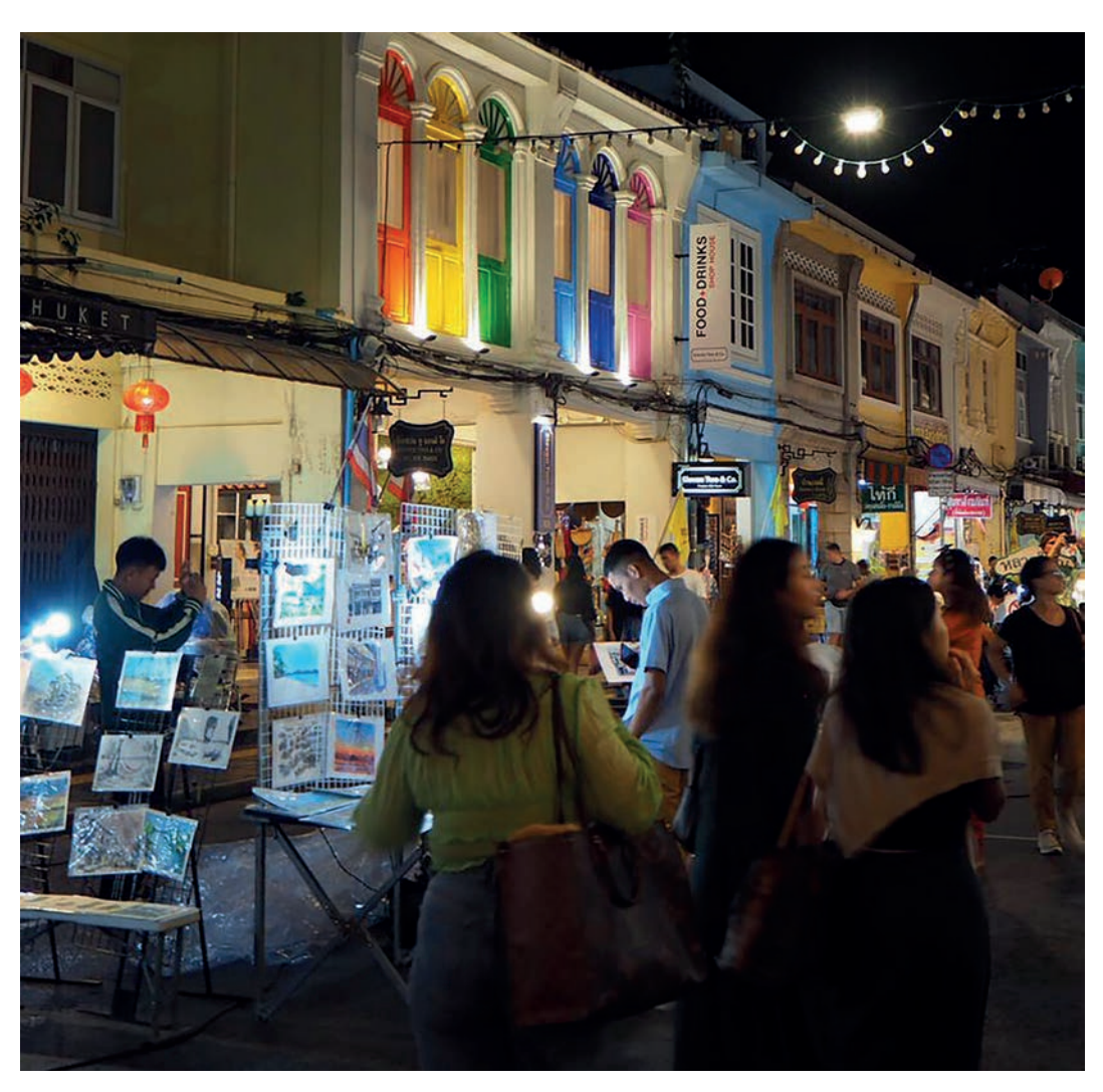
Fig. 5.1 for Question 5